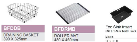
BFDDB DRAINING BASKET 390 X 325mm